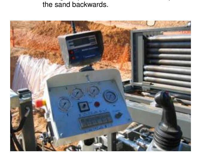
The control station allows a good view onto all functions.